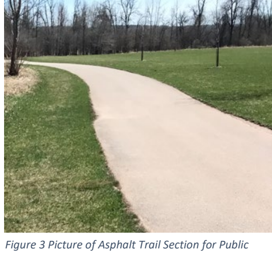
Figure 3 Picture of Asphalt Trail Section for Public Art