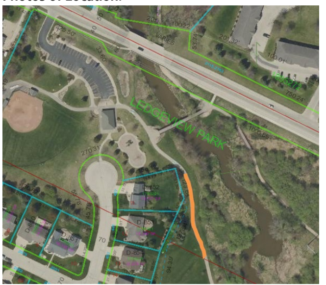
Figure 1 Trail Painting Location on East River Trail (sections in orange)