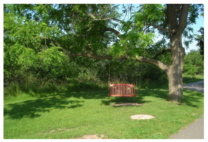
Figure 2 Swing along East River Trail